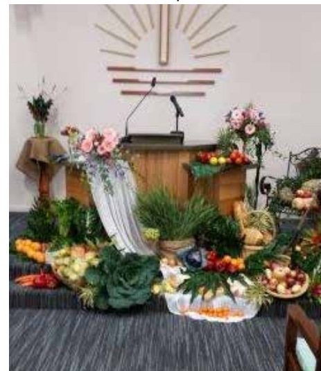
North Ipswich, Qld