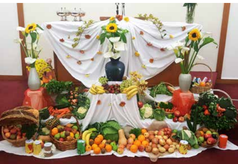
New Lynn, NZ