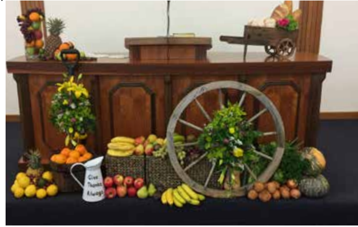
Hope Valley, SA