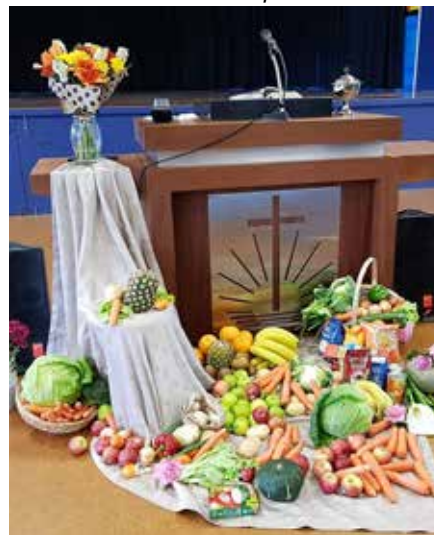
North Shore, NZ