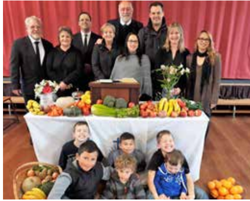
New Plymouth, NZ