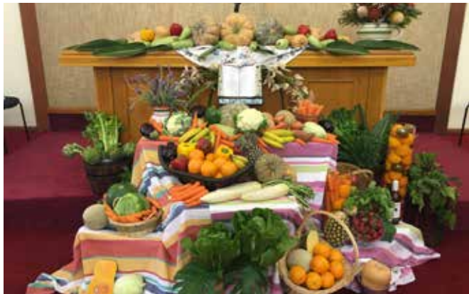
Seven Hills, NSW