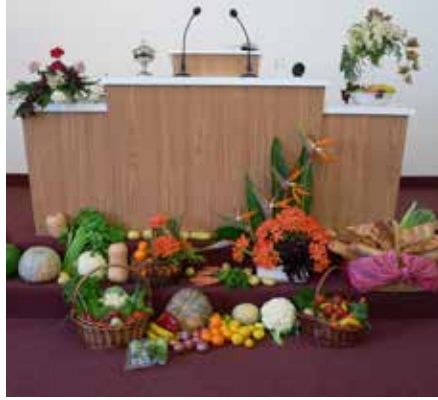
Ascot Park, SA