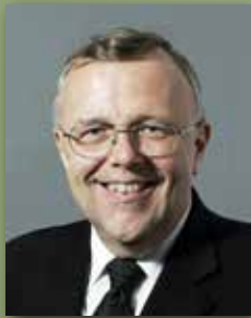
District Apostle Urs Hebeisen